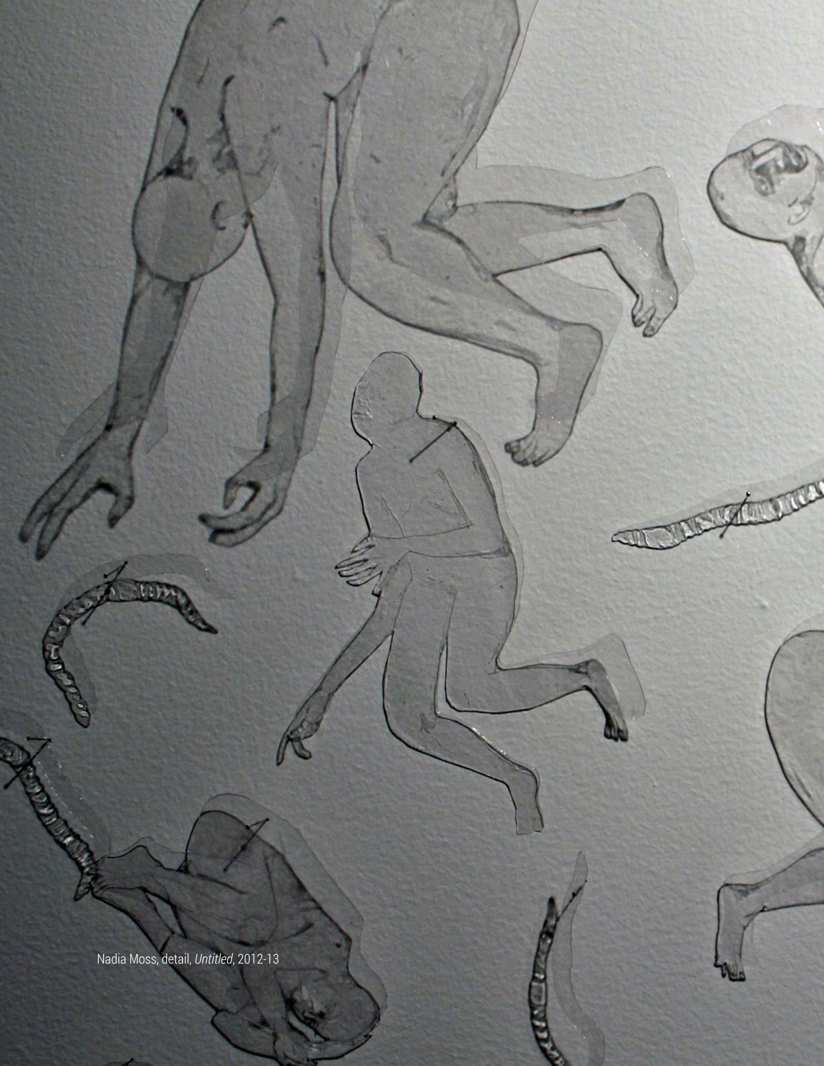
Nadia Moss, detail, Untitled , 2012-13