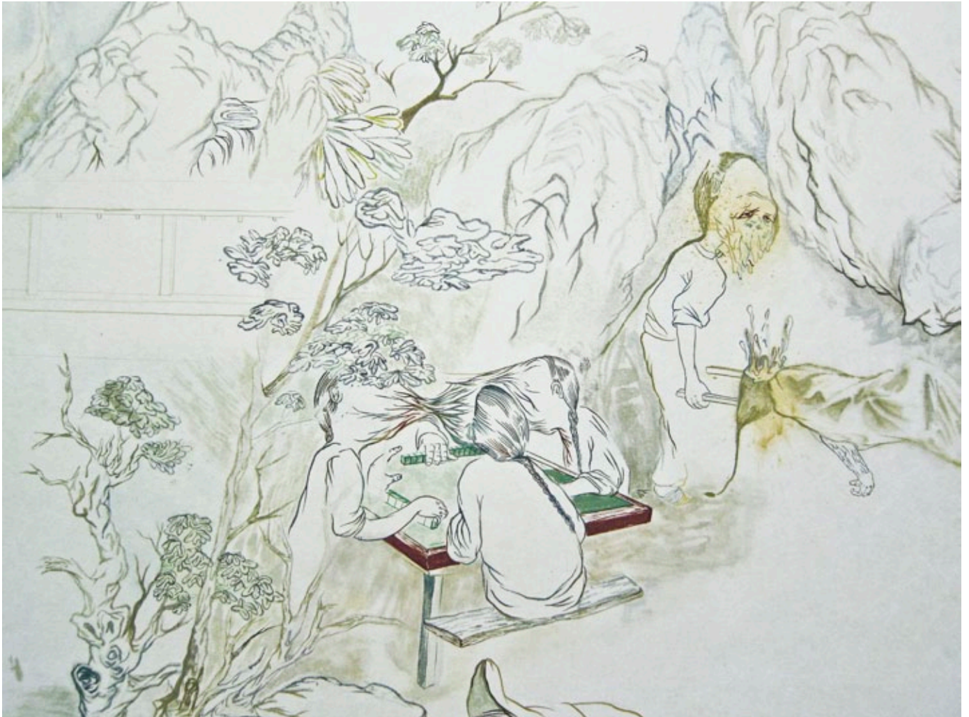
Howie Tsui, details, The Unfortunates of D'Arcy Island , 2013