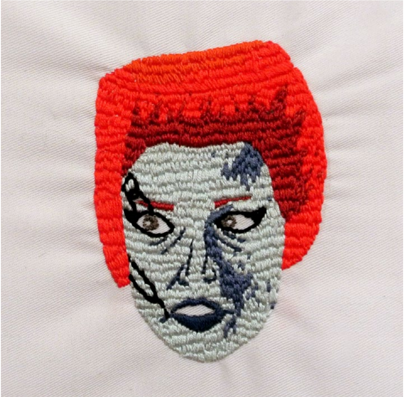
Emily Gove, Girl Gang: Trash , 2013 Emily Gove, Girl Gang: Blondie , 2013