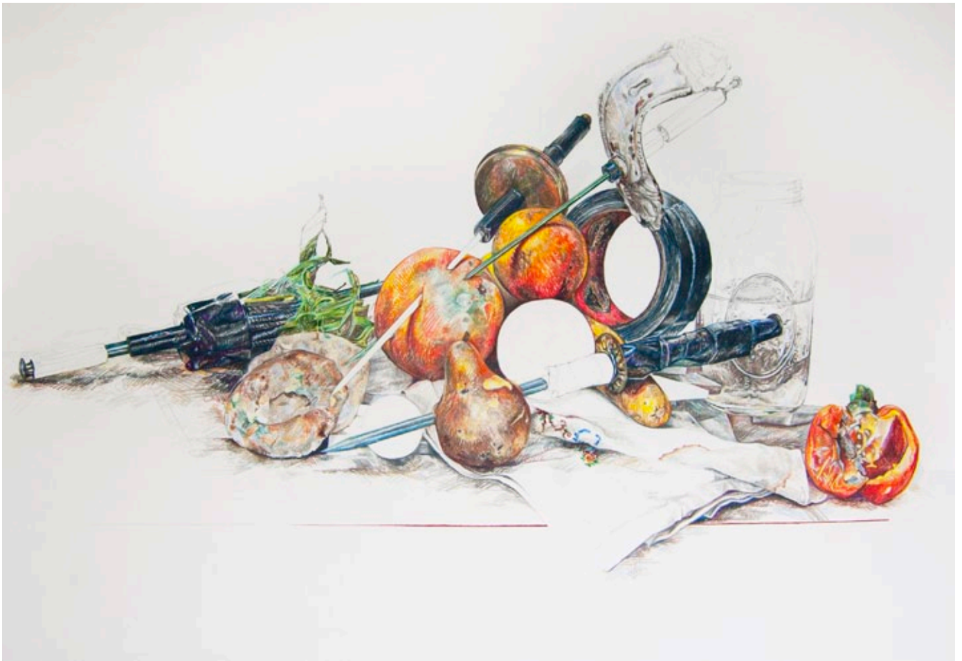
Atom Cianfarani and Maya Suess, Survival Object i , 2013 Atom Cianfarani and Maya Suess, Survival Object ii , 2013