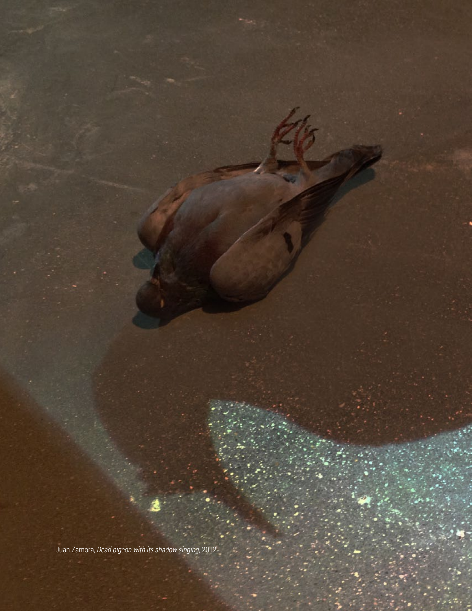
Juan Zamora, Dead pigeon with its shadow singing , 2012.